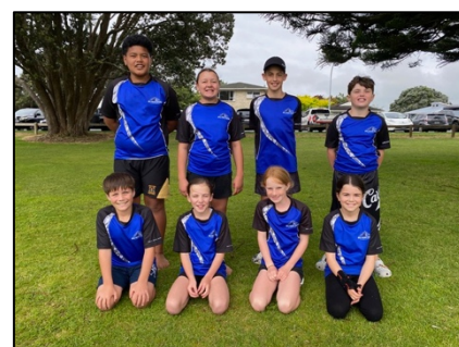
Bell Block Blast touch team

A reminder to return all sports uniforms and Player of the Day trophies to the office as soon as possible please.