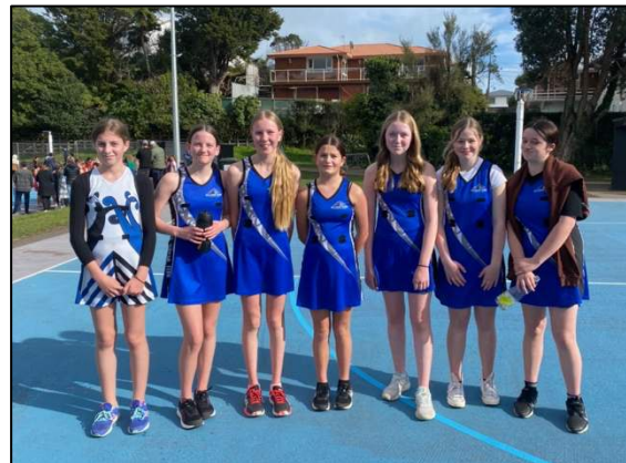
Bell Block Tactix – Year 8 netball team