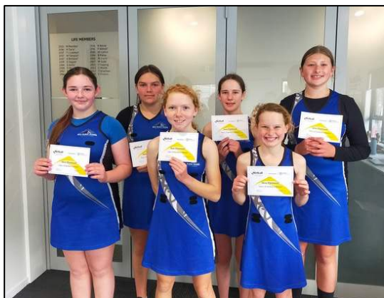
Bell Block Steel – Year 7 netball team

If you have any queries, please email sport@bellblock.school.nz or telephone the office on 755 0838