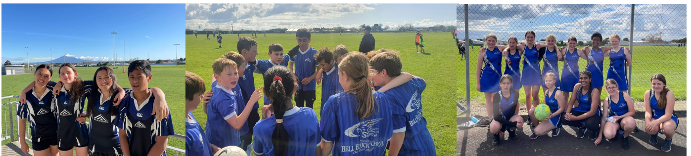
Intermediate students attending the Interschool Sports Tournament in Hawera to compete in rugby, football and netball against other Taranaki schools

We need volunteer coaches in order for our school sports teams to go ahead. The teams will not be entered without a coach to support them. Please, if you can help coach a touch team, intermediate cricket team, hockey team, or Year ½ netball team, please contact me as soon as possible by email to sport@bellblock.school.nz